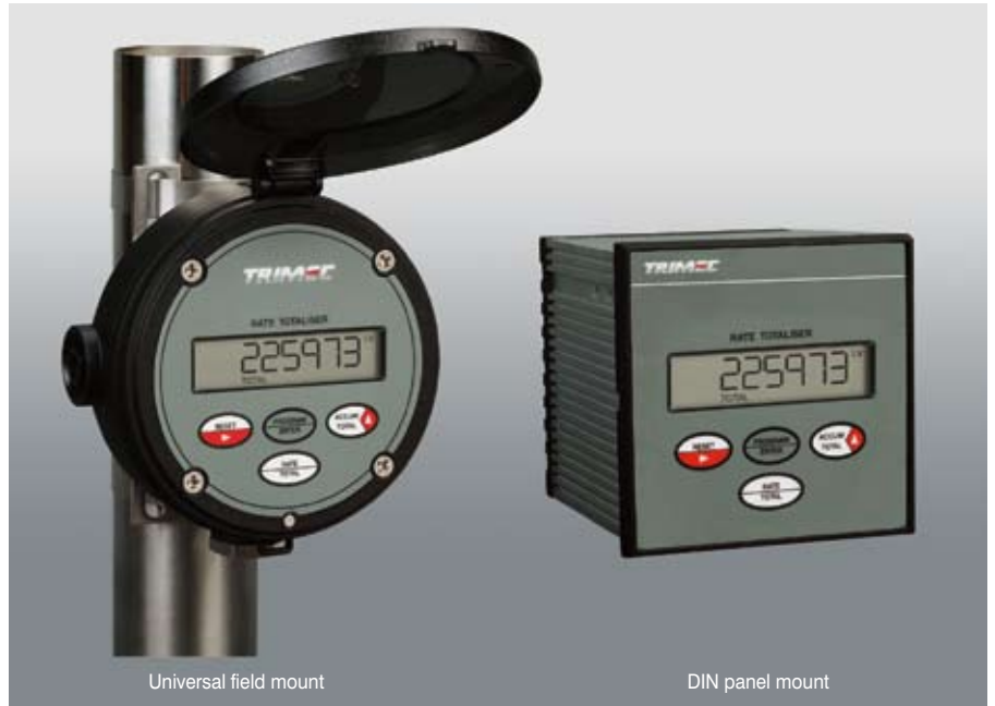
Universal field mount