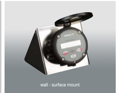
wall - surface mount