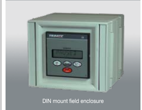
DIN mount field enclosure